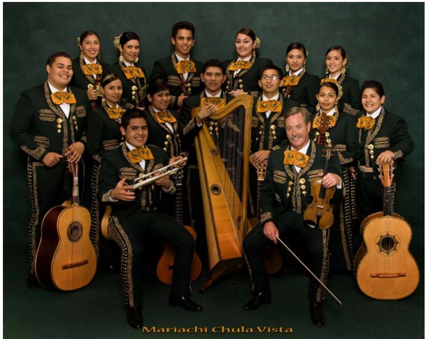
Mariachi “Chula Vista” performing at the 2009 California Mid-Year Conference

Forumeer on the Web: http://www.agif.org